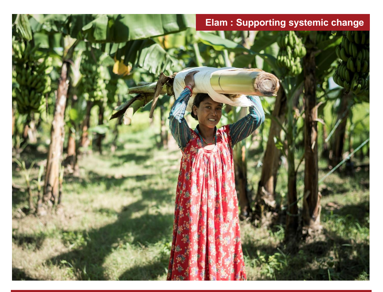
Making the banana market work for Nepalease farmer, traders and cosumers

Bananas are one of the most commonly eaten fruits in Nepal, enjoyed by all – from elites to the poor, depending on the price. The price, however, varies considerably through the year, in part due to some seasonality and in part due to the import of Indian bananas, which distorts the local market. Banana taste and quality also varies greatly according to the variety and the place of production. Although locally grown bananas are highly prized in the hills, commercial banana cultivation is focused in the Terai. In 2014, Helvetas conducted an assessment of the market potential of various small enterprises in the Terai and recognised the banana value chain as one with high growth potential. We identified a variety of production constraints, including poor quality planting material; low availability of the varieties most favoured in the market; limited yields due to inadequate water supply; and high losses due to adverse weather events. We further found that farmers often received a very low price for their bananas, and that there was under-exploited potential to develop side-products from banana fibre. This briefing note documents the way in which Helvetas has facilitated changes in the Nepalese banana value chain that have benefitted small farmers, traders and consumers.